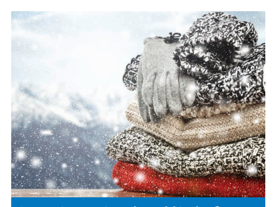
Protection against the cold is the first treatment and usually the only one required.

The entire body should be kept warm throughout, as if ensconced in a heat bubble. It is easier to keep warm than to warm up once the body temperature begins to fall. A surplus of heat without, however, crossing the body sweating threshold will be redistributed to cold areas such as the hands and feet. Here we are introducing the multilayering concept where